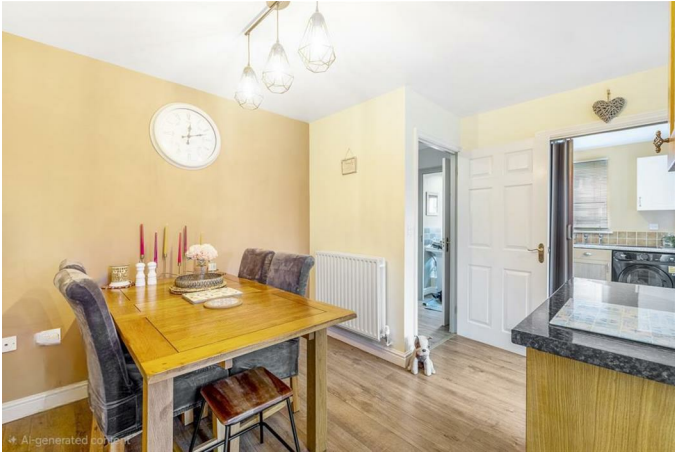
Utility Room 5'6" x 8'11" (1.70m x 2.73m)