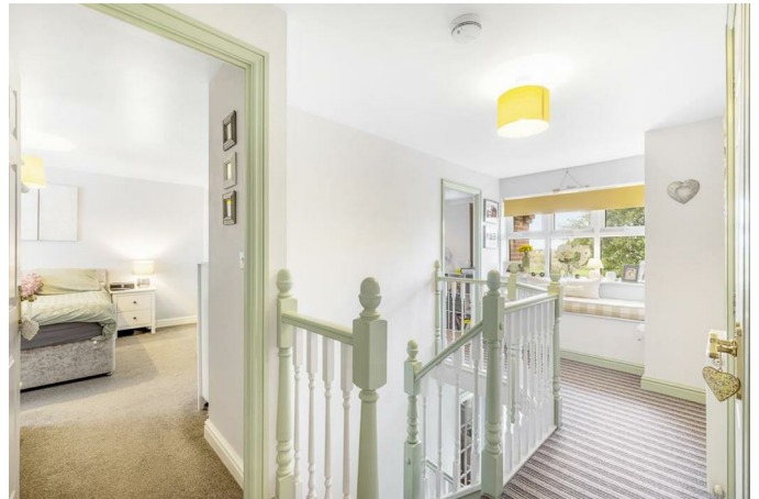
Galleried Landing 15'11" x 7'4" (4.87m x 2.25m)

PVC double glazed window to front. Bench seating area. Skimmed ceiling. Loft access. Radiator. Double door airing cupboard with wall mounted mains gas combination boiler and slatted shelving. Doors to bedrooms and bathroom.