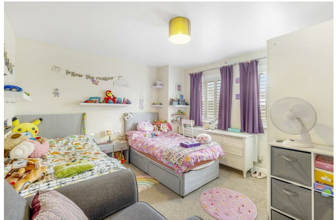
Bedroom 3 10'11" x 12'5" (3.33m x 3.81m)

PVC double glazed windows to front with built in shutters. Skimmed ceiling. Radiator. Built in wardrobe with fitted shelving and hanging rail.