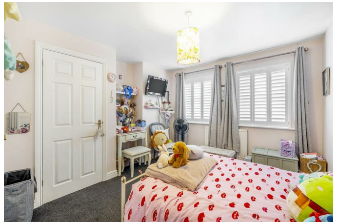
Bedroom 2 12'9" x 10'11" (3.90m x 3.33m)

PVC double glazed windows to front with built in shutters. Radiator. Skimmed ceiling. Built in double door wardrobe with hanging rail and slatted shelving. Door to en-suite.