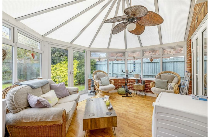
Conservatory 12'0" x 15'3" (3.68m x 4.65m)

Of brick and PVC construction with polycarbonate roof. French doors opening to garden. Laminate flooring. Power points. Wall mounted electric heater.