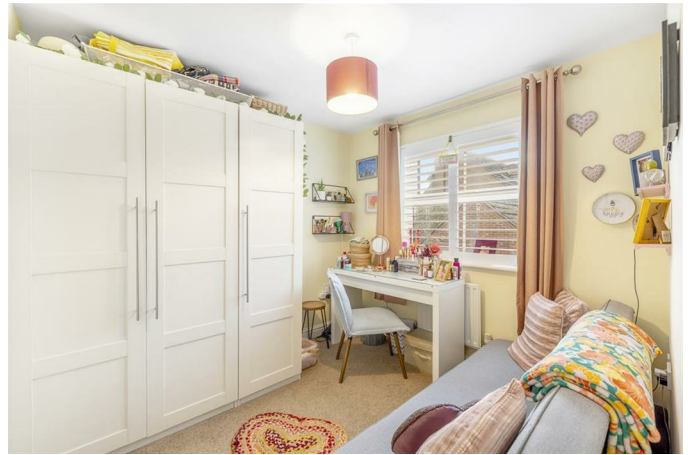
Bedroom 4 8'8" x 8'4" (2.65m x 2.55m)

PVC double glazed window to rear with built in shutters. Skimmed ceiling. Radiator.