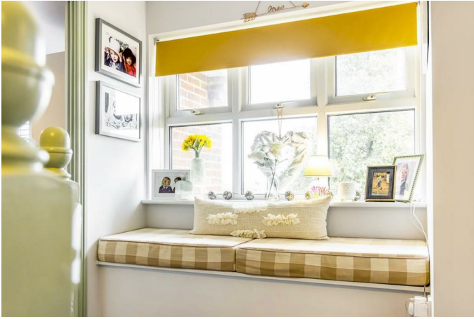
Bedroom 1 15'7" (into cupboard) x 12'3" (4.77m (into cupboard) x 3.75m)